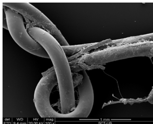
Fig. 4. The Monocryl plus suture knot material seen under the scanning electron microscope, 100x.