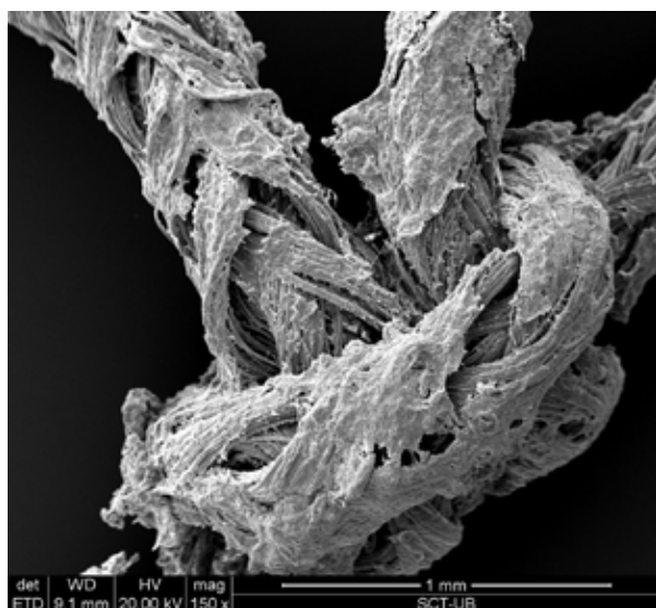
Fig. 3. The natural silk suture knot material seen under the scanning electron microscope, 150x.

opening, pain and swelling in the surgical zone still present on the third postoperative day. The bacterial flora responsible for odontogenic infections is diverse. In the present study, the number of bacterial species and colonies was greater in the case of aerobic microorganisms ( n = 12 ) than for anaerobes ( n = 5 ), presumably as a result of selection of the culture media. On the other hand, this circumstance may possibly explain the relatively low incidence of infectious complications recorded. Studies on oral and cervicofacial infections of odontogenic origin have also detected a predominantly aerobic flora (22,23). In the present study, the use of Monocryl® Plus suture yielded the lowest counts of both aerobic ( p=0.001 ) and anaerobic organisms ( p=0.017 ). Streptococci belonging to the viridans group were most