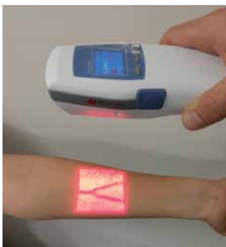
Fig. 1: Demonstration of the VVD application for the detection of superficial veins in the arm.

Damage to the palatal neurovascular bundle (NVB) which comprises greater palatine artery, vein and nerve together may lead several complications during the surgery (3). NVB injury may result in post-operative palatal paresthesia (4). Additionally, perforation of the blood vessels may lead excessive bleeding as well. The management is a disturbing and time-consuming process which may lead completion of the procedure with poor treatment outcomes (5). The possibility of this hemorrhagic complication may limit clinician from harvesting the optimum sized grafts required for the treatment demands (6). Direct pressure to the bleeding site, topical administration of hemostatic agents, laser applications, electro-surgery and suturing were suggested to be beneficial for obtaining hemostasis to some extent (7). Considering the above mentioned complications, prevention from this injury is a crucial concern in palatal graft harvesting surgery. Numerous cadaver and radiological studies suggested "safe" distances from the adjacent teeth to palatal vessels to guide clinicians for the determination of surgical borders of palatal donor sites during the graft harvesting (3,8-11). However, considering the anatomical variations use of these morphometric reference distances is not valid for each individual (4). Recent advances in the medical imaging devices allow real-time visualization of superficial veins under the skin (12) (Fig. 1). A laser assisted near-infrared vein