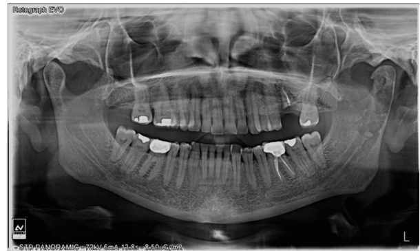
Fig. 1. Ortopantomography. Left mandibular ramus and left condylar neck radiolucid lesion.

a radiolucent, multi-lobed, well circumscribed lesion, in the left mandibular ramus and condyle (Fig. 1). A computed tomography scan (CT) showed a well-defined multi-lobed radiolucent lesion with septa within, of 41 x 11mm craniocaudal and anteroposterior axes respectively, with values of attenuation in the range of fat. The lesion was located posterior to the alveolar nerve channel, and a thinning and a focal discontinuity of the vestibular cortex could be appreciated in the mandibular ramus. A magnetic resonance imaging (MRI) revealed a hyperintense lesion in T1 and T2 weighted sequences, a typical signal of fat (Fig. 2). All these features were consistent with the diagnosis of intraosseous lipoma. A biopsy under general anaesthesia using a preauricular approach was performed. During surgery, a well-defined resorption of the external cortex of the left mandibular ramus and the condylar neck could be seen, as had been anticipated by the CT image. The lesion was located in the mandibular medullary cavity and had the appearance of fatty tissue. Resection was performed by curettage and filling the defect was not considered to be necessary.