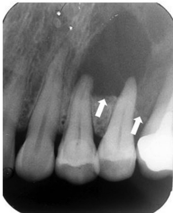
Fig. 3: A periapical radiograph of a central mucoepidermoid carcinoma shows ill-defined radiolucent area at the left posterior maxillary region. Inferior border of the lesion is indicated by arrows. The superior and posterior borders of the lesion cannot be revealed on this periapical radiograph.

logically rendered as non-endodontic periapical lesions. The frequencies of non-endodontic periapical cases in our study were higher than those of previous studies, reporting from 0.64 to 4.22% of periapical radiolucent lesions as shown in Table 3 (1-3,5-7). The male to female ratio in our study was 1.3:1. The slight male predilection of our study is consistent with those of Huang et al. (1) and Kontogiannis et al. (5) but in contrast to other studies (2,3,7) in which females were predominant. The frequencies of cases occurring in the maxilla compared with those in the mandible did not differ much. Approximately 52% of non-endodontic lesions occurred at the maxilla and 48% occurred at the mandible. Eighteen different histopathological diagnoses were identified in our study. The result is consistent with