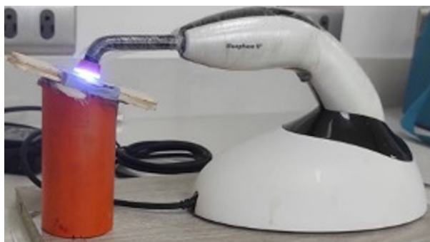
Fig. 2: Device designed to ensure a 1 mm distance during polymerization.

The lamp tip was positioned perpendicular to the surface of the resin disc, at 1 mm in the 24 samples corresponding to groups 1 and 3, and at 6 mm in the 24 samples belonging to groups 2 and 4. To ensure this spe-