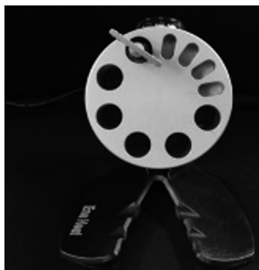
Fig. 1: EnaHeat Heater.

The discs were divided into 4 groups, each containing 12 specimens, with 3 specimens of each resin type in each group. In groups 1 and 2, the resin was processed at a controlled temperature of 23°C using an air conditioning system and a thermohygrometer. In groups 3 and 4, the resin was preheated using the Ena Heat heater from the Micerium group (Fig. 1). This device, designed to heat resin syringes, allows reaching temperatures of 39°C (recommended by the manufacturer for restorations) and 55°C (recommended for resin use as a cementation material). On this occasion, the resin was preheated to a