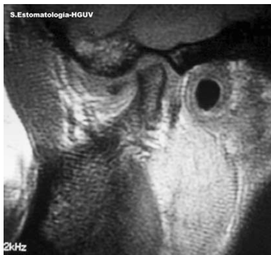
Fig. 3. Condylar leveling and anterior displacement of the disc in a patient with osteoarthritis.

Of particular importance for the clinician is prediction of