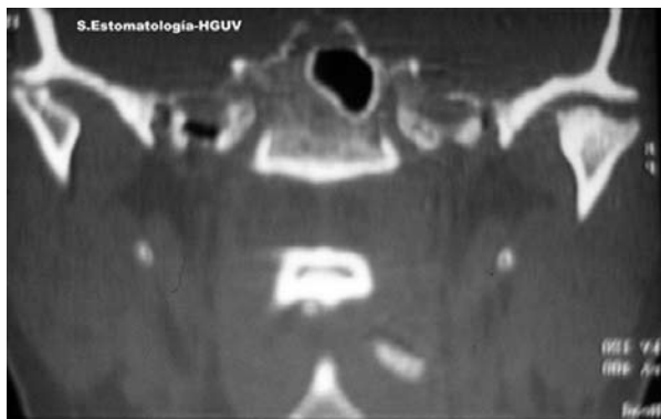
Fig. 1. Computed tomography (CT) exploration of the temporomandibular joint (TMJ). Leveling, erosion, osteophyte formation, and reduction of the joint space.