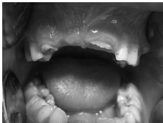
Fig. 1. Intraoral view of upper right area with regional odontodysplasia.

The periapical radiographs of the affected teeth demonstrated very thin dentin and enamel layers. The demarcation