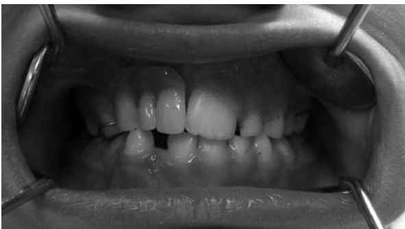
Fig. 5. The affected edentulous quadrant was rehabilitated with an acrylic partial denture.