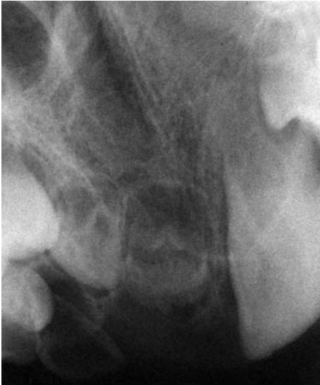
Fig. 3. Periapical radiograph showing the characteristically ghost-like appearance of regional odontodysplasia.