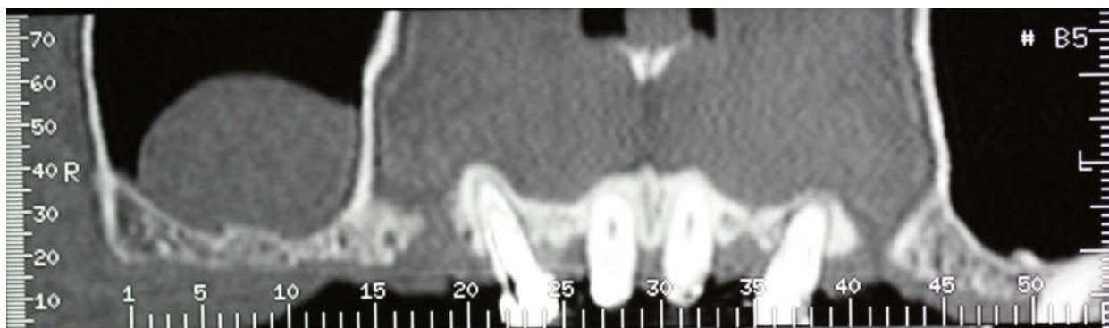
Fig. 2. CT panoramic scan in which a dome-shaped image can be observed.