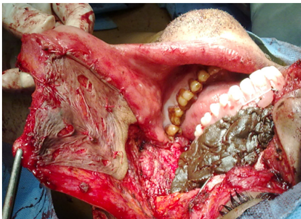
Fig. 2. A split thickness skin graft was applied under the soft tissue flap to line the surgically produced cavity especially the cheek row area.

immediate surgical obturation, to be used later as anchorage for prosthesis.