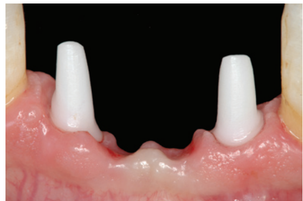
Fig. 2. Soft tissue healing 6 months after surgery.

Wolhusen, Switzerland) were performed. A surgical guide obtained by wax up on pre-operative casts was used in all cases to achieve implants' optimal position and inclination. Implant site preparation was performed in order to leave implant abutment with smooth neck heal transmucosally, whereas implant body rough surface was left completely inside the bone. Flaps were sutured with 4/0 monofilament suture (Premilene®, Braun Melsungen Germany). When necessary before suturing flaps, periosteal releasing incisions were performed to attain primary wound closure. Patients were given oral hygiene suggestions and were instructed not to chew or eat on implant site until healing was completed and to continue with antibiotic therapy and chlorhexidine mouth-rinses and use of analgesic, Paracetamol 500mg, (Tachipirina®, Angelini, Roma Italy) if necessary. Sutures were removed 7 days after surgery. Follow-up controls were programmed after 1 week, 2 weeks and subsequently once a month for the following 6 months. (Fig. 2)